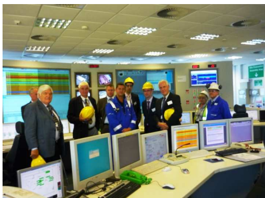
The Control Room at Didcot B

This was followed by a very informative guided tour of both Didcot Power Stations A and B.