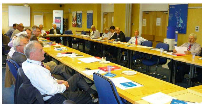
Some of the participants