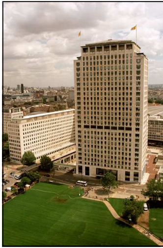
Head Office Shell UK Ltd