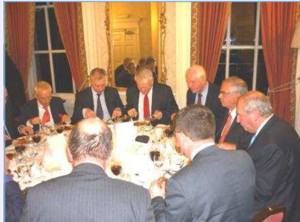
Participants during the dinner