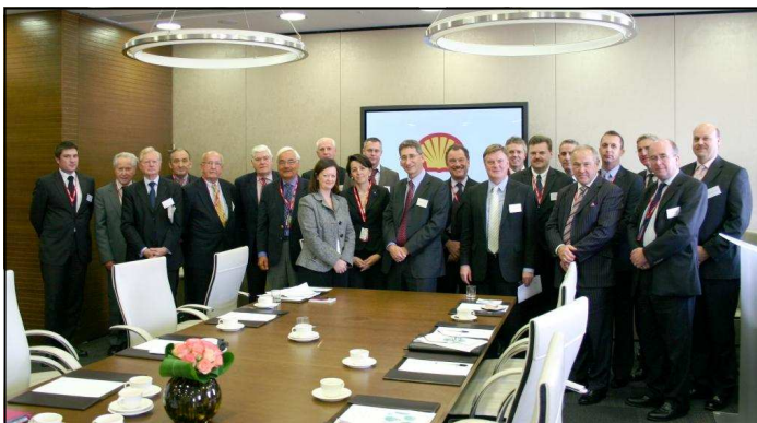
Speakers from Shell and members of GI UK