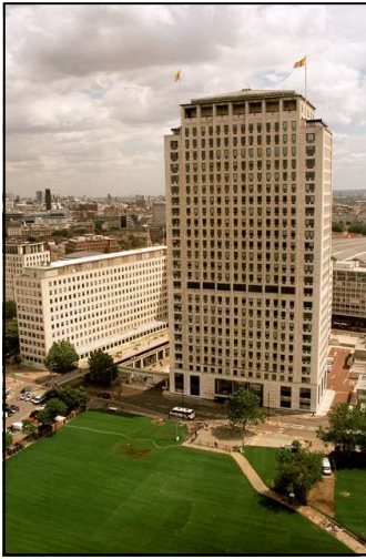
Head Office Shell UK Ltd