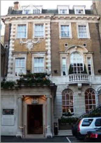
Royal Over-Seas Club