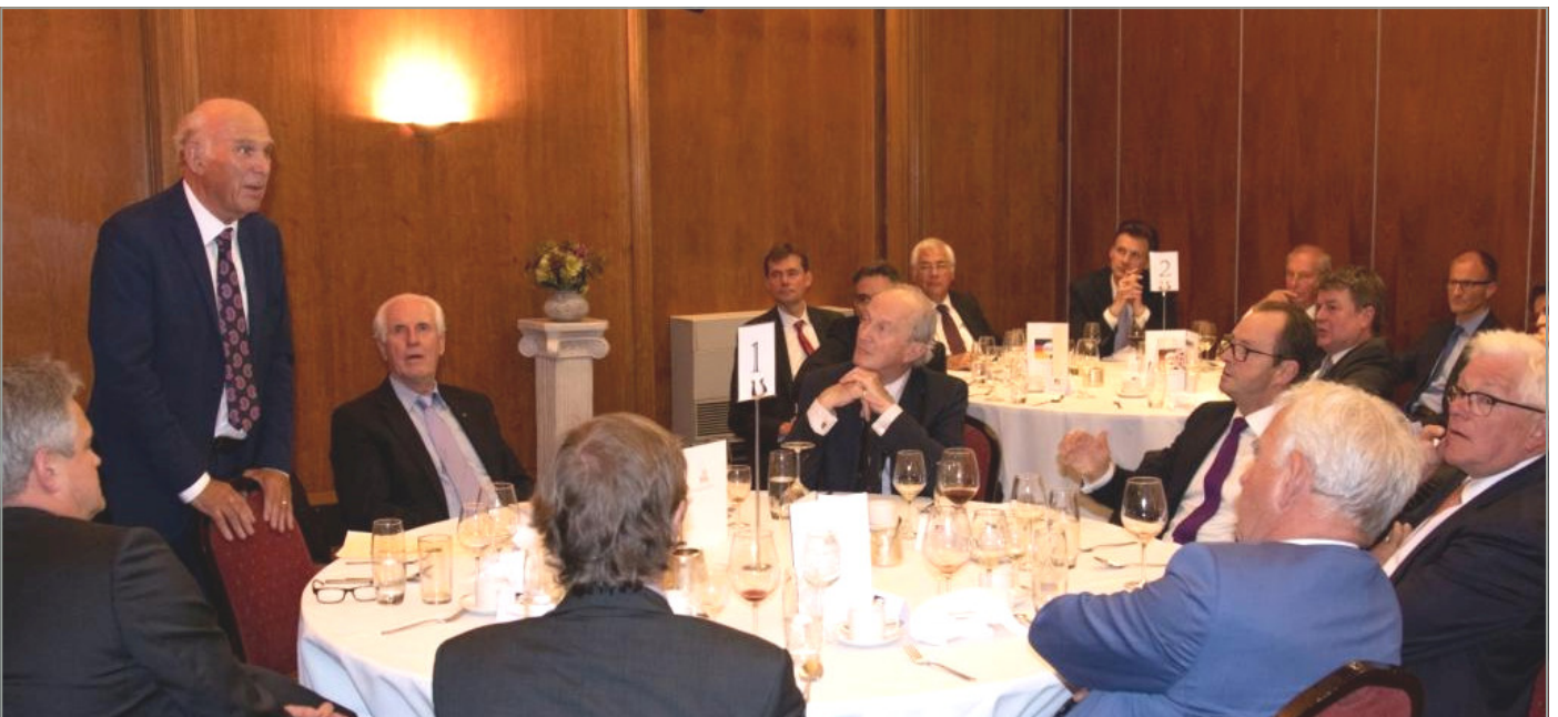
Rt Hon Sir Vince Cable MP speaking

This was a very rewarding evening for us all with a very lively discussion.