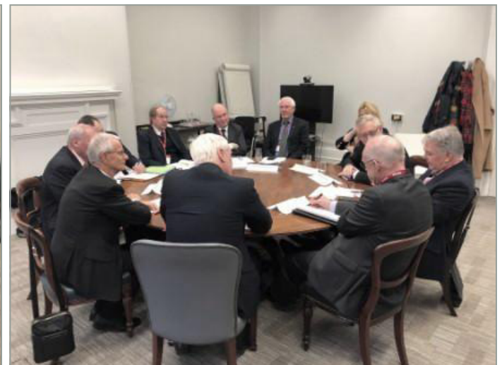
Participants at the meeting