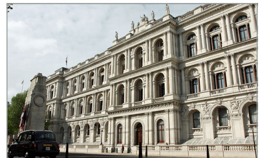
Foreign & Commonwealth Office