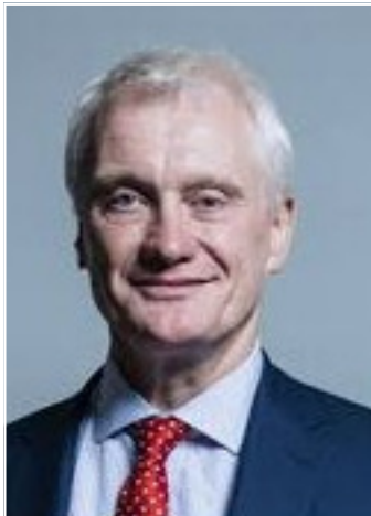
Mr Graham Stuart MP

On Monday, 24 February 2020, the GIUK Board and Advisory Council had a Roundtable Discussion with Mr Graham Stuart MP to talk about post Brexit transition, productivity and skills in the Department for International Trade at the Foreign & Commonwealth Office.