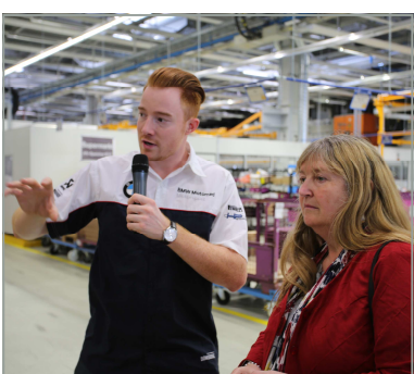
Guide through the factory and meeting two of the trainees